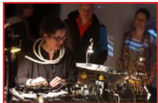
“Saló Sonor” at Worldtrionics fest (HKW, Berlin)